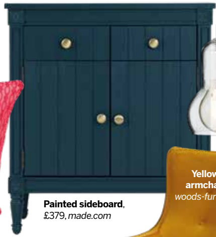
Painted sideboard. £379, made.com