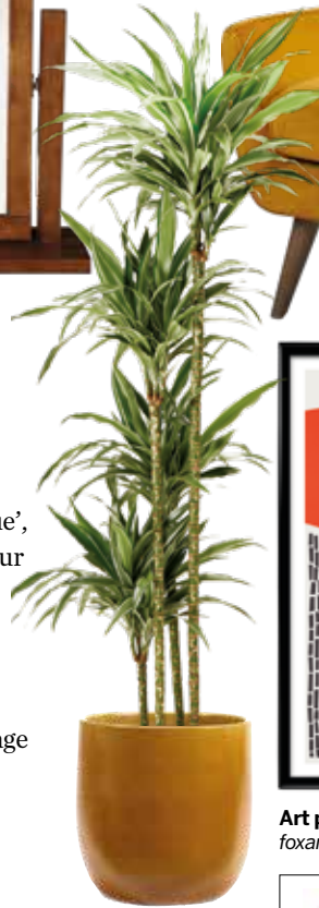
Plant. £45, ikea.com ; pot. £29, abodeliving.co.uk

Think cosy textures for a luxurious feel, and calming or deep colours to create an enveloping backdrop to a room. Let your imagination run wild!