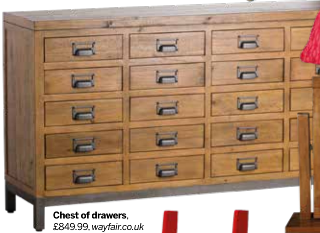
Chest of drawers. £849.99, wayfair.co.uk