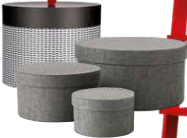
Hat boxes: with black lid. £15, johnlewis.com ; set of three grey boxes. £15, ikea.com