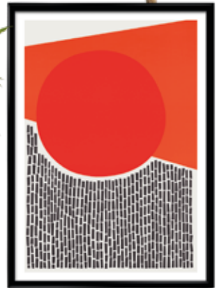
Art print, from £16.95, foxandvelvet.etsy.com