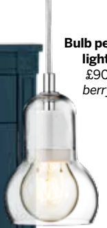
Bulb pendant light, from £90, cloudberryliving.co.uk