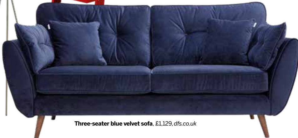
Three-seater blue velvet sofa. £1,129, dfs.co.uk