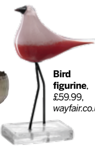
Bird figurine. £59.99, wayfair.co.uk