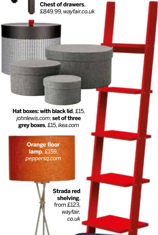
Strada red shelving. from £123, wayfair.co.uk