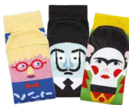
Fun on their feet! Chatty socks, £8 a pair, shop.nationaltheatre.org.uk