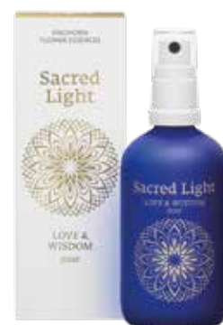
Spritz and sparkle. Sacred Light flower essences, £17.50, yogamatters.com