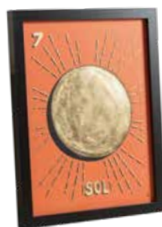
Add sunshine to walls. Sun foil wall art, £59.50, oliverbonas.com