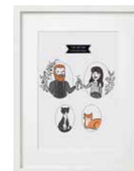
Put your pets in the picture. Customised portraits, from £20, lizsmithillustration.com