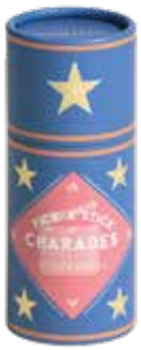
Fun for everyone. Charades tube, £7, oliverbonas.com