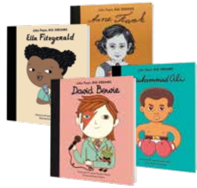
Inspirational bedtime stories. Little People, Big Dreams books, from £5.99, waterstones.com