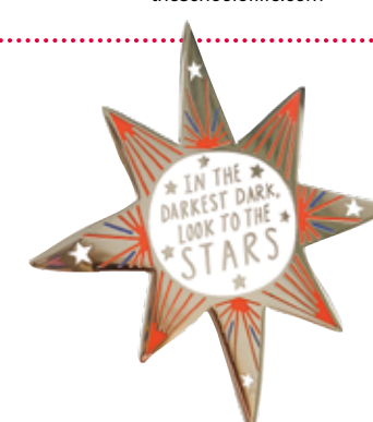
Remember to look up and marvel. Metallic star pin , £10, bonbiforest.com