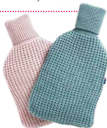
Warmth for winter months. Hand-knitted hot-water bottle covers , £25 each, yogamatters.com