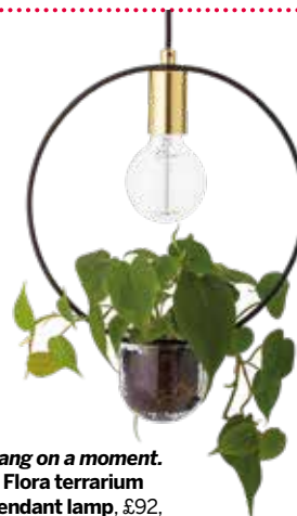
Hang on a moment. Flora terrarium pendant lamp, £92, beaumonde.co.uk