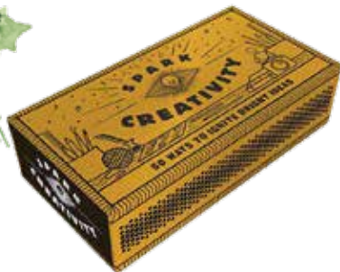
Ignite their imagination. Ideas prompt box, £11.99, yogamatters.com

Inspire someone to express their creative side this Christmas, with this round-up of quirky presents