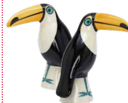
Seasoning's greetings! Toucan salt and pepper shakers, £25, hannaeturnershop.etsy.com

Those with pets and four-legged companions will adore these animal-inspired pressies