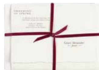
Plant now for a spring spectacle. Christmas sweetpea bundle , £15, thefuturekept.com