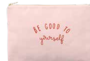
Send a positive message. 'Be good to yourself' bag, £20, alphabetbags.com