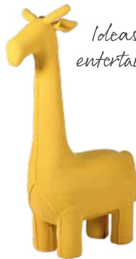
Sitting pretty. Giraffe stool, £275, sweetpeaandwillow.com

Ideas to keep those cherished youngsters in your life entertained, from babies and toddlers to older children