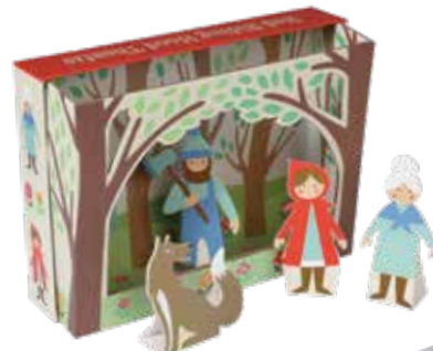
Who's afraid of the big bad wolf? Red Riding Hood puppet theatre, £6.95, rexlondon.com