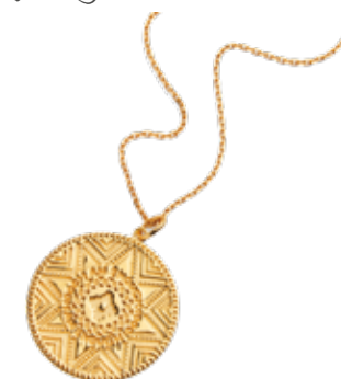
Remind someone you care. 'I am enough' necklace, £110, notonthehighstreet.com