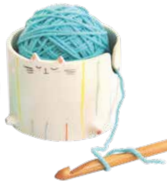
To have and to hold. Cat yarn bowl, £44, redcandy.co.uk