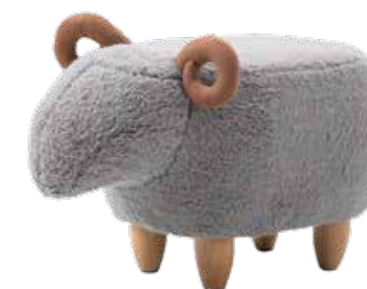
Baa humbug? Put your feet up. Ram footstool, £69, redcandy.co.uk