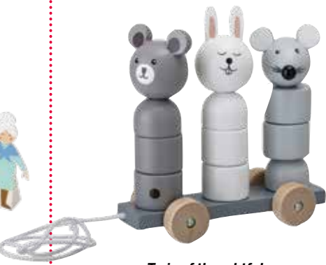
Train of thoughtful. Wooden pull-along toy, £33, andliving.co.uk