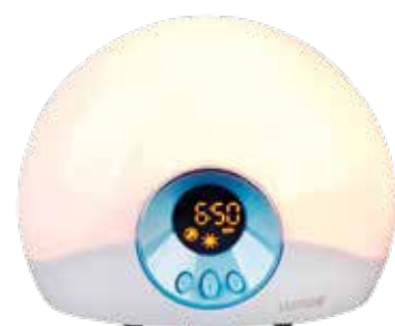
Brighten dark days. Body clock starter SAD light, £59.99, johnlewis.com