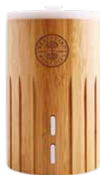
Create a calming ambience at home. Esta diffuser , £57.50, nealsyardremedies.com