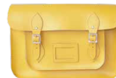
Choose handmade handbags. Yellow satchel, £105, sirgordonbennett.com