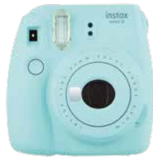
Get the kids snapping. Fujifilm Instax Mini 9 camera, £109, littlewoods.com