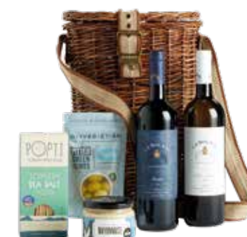
Snack, cracker, pop! Wine duo and nibbles basket , £70, johnlewis.com