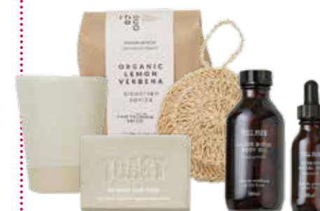
Spoil a dear friend. Wellness hamper, £99, toa.st