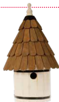
Bird's-eye view. Dovecote birdhouse , £35, nationaltrust.org.uk