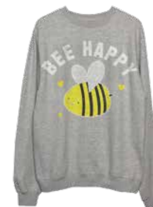
Share joyful vibes. 'Bee happy' sweatshirt, £34, notonthehighstreet.com