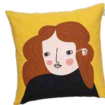
Choose quirky home furnishings. Face cushion, £24.50, husandhem.co.uk

We've chosen these uplifting tokens with our loved ones in mind