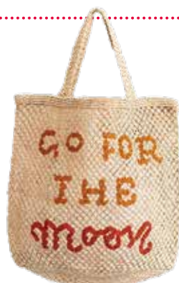
Reach for the stars. The Jacksons 'Go for the moon' handmade jute bag, £78, notonthehighstreet.com