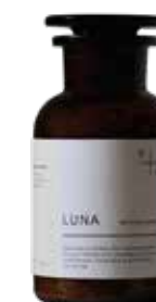
Soak up the spa feeling. Luna bath salts, £30, essenceandalchemy.com