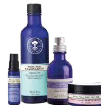
Hello, sweet slumber. Beauty Sleep bedtime collection , £50, nealsyardremedies.com