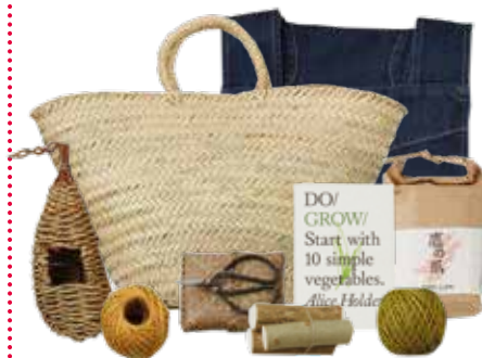
A special something for green-fingered friends. Outdoor hamper , £135, toa.st