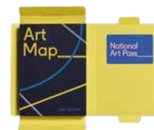
Go on a cultural journey. National art pass and map , £70 per year, artfund.org