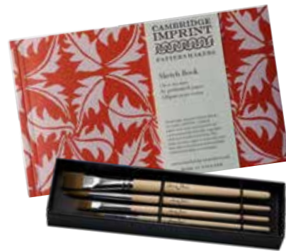
For art's sake. Sketchbook, £12.50, cambridgeimprint.co.uk ; detail brushes, £14.95, anniesloane.com