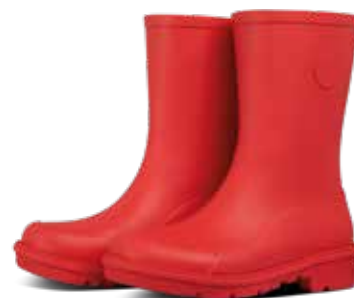
Goodbye wet feet and socks. Wonderwelly boots , £75, fitflop.com