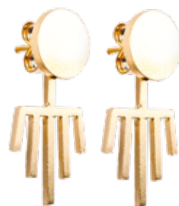
Light up their faces. Sunburst earrings, £58, wanderlustlife.co.uk