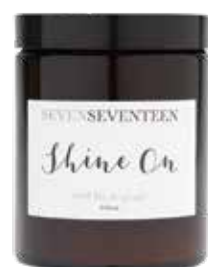
Let it glow. Shine On candle, £22, deptstoreforthemind.com

It may be dark outside but you can bring a little warmth into someone's life with these bright and sparkly gifts