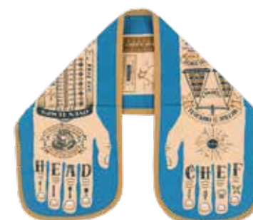
Ready, steady, cook! 'Head chef' double oven glove , £23.50, redcandy.co.uk