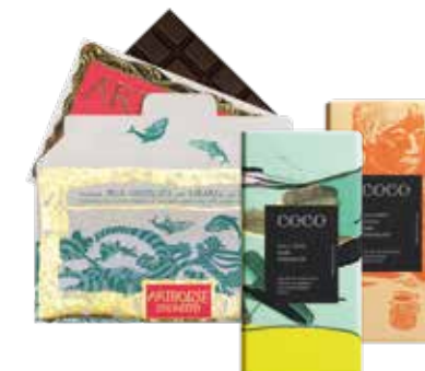
Satisfy their sweet tooth. 'Try something new' chocolate gift box , £16.45, postboxed.co.uk