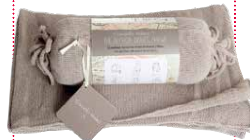
For exploring in style. Alpaca travel shawl/pillow , £120, samanthaholmes.com