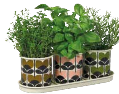
Fresh and fragrant greens. Orla Kiely three-herb pots with tray (herbs not included), £49.95, cuckooland.com

Treats for all those epicureans you know, from aspiring chefs to budding bakers and chocolate lovers