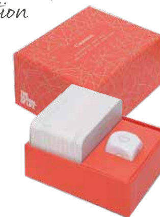
Appreciate the ones you love. Connect game , £20, theschooloflife.com