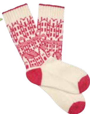
Cosy toes. Cashmere knitted socks , £36, whitehallstudio.etsy.com

Delight those who care about their health and wellness with pampering, handmade and comforting items