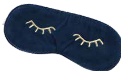
Drift off in peaceful serenity. Sleeping eye mask , £12.50, oliverbonas.com