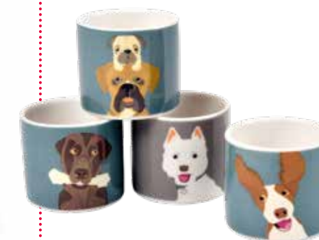
Make breakfast egg-cellent. Dog egg cups, £12.95 for a set of four, annabeljames.co.uk