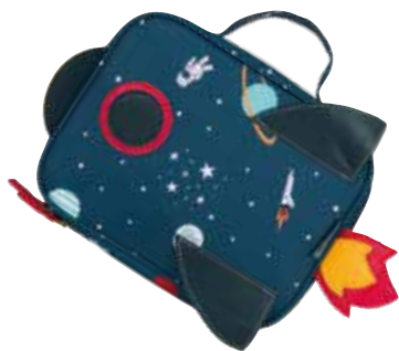
Celebrate their intrepid nature. Space-themed lunch bag, £20, sophieallport.com