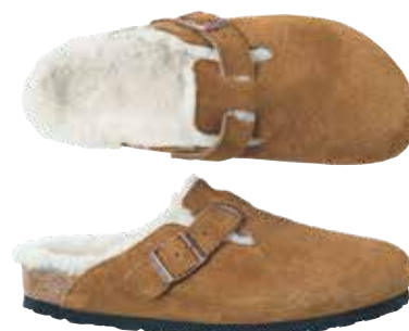
Slip into ultimate comfort. Birkenstock sheepskin slippers , £135, toa.st