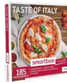
Enjoy a pizza Italia. Taste of Italy gift experience , £29.99, johnlewis.com