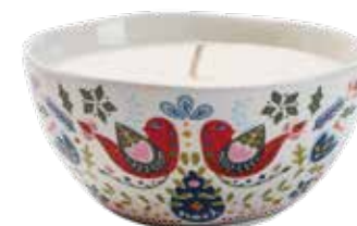
Get into the spirit. Festive bowl candle, £17.50, whitestuff.com

A few goodies we're hoping to find under the Christmas tree this year