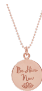
A reminder to live in the moment. 'Be here now' necklace , £45, mantrajewellery.co.uk