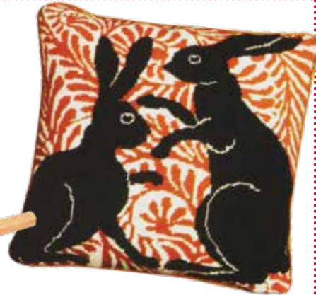
Knock-out gift. Boxing hares tapestry kit, £67.50, libertylondon.com