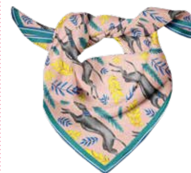
Fine print. Greyhound motif silk scarf, from £45, catherinerowedesigns.etsy.com

• To find out more about 'Small Wonders', see nationaltrust.org.uk