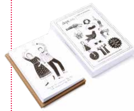
Show your gratitude. Box of blessings greetings cards , £15, deptstoreforthemind.com

Connect with what's truly important and count your blessings with this grounded curation