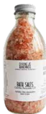
Soothe aching muscles. Pink Himalayan bath salts , £6.90, wearthlondon.com