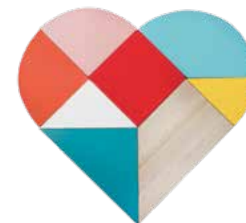
It all fits into place. Multicoloured trivet and coasters , £19.50, redcandy.co.uk