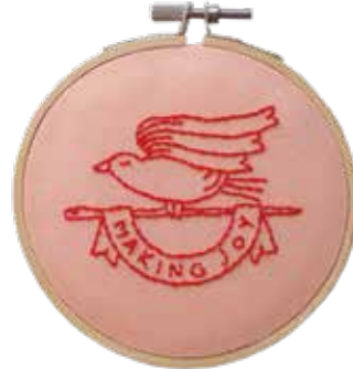
Sew joyful... Embroidery kit, £12.95, cottonclara.etsy.com