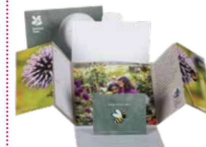
Save the world's wildlife. 'Small wonders' bees gift (includes bee pin), £15, nationaltrust.org.uk