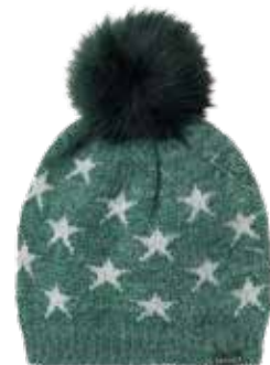
Keep heads warm on wintry walks. Star knit child's beanie , £12.50, fatface.com